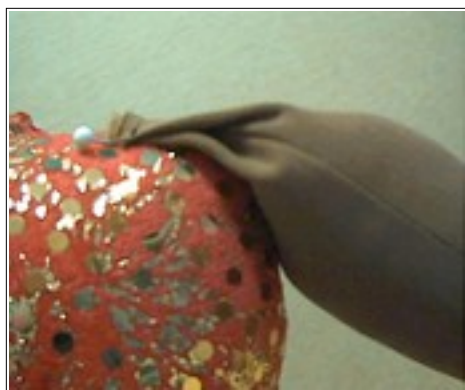
One arm pinned in place.

Be sure to have the hands facing the correct direction! Thumbs to the front. Sit back on your hands to see how your hands would be. Whip stitch them in place. It won't show.