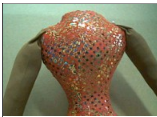
Both arms pinned in place.

Note how the arm tops drape over the shoulders. The edge of the shoulder plate will be pulled down tight to the stuffed part of the arms and the unstuffed part will be under the shoulder plate when we are done.