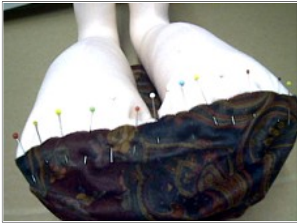
The back edge all pinned in.