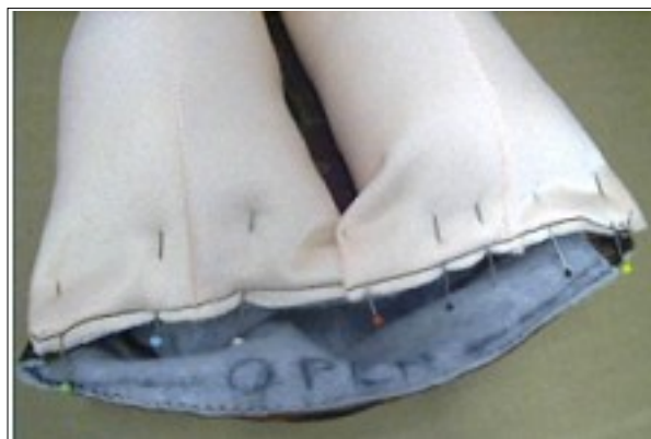
Sew the leg tops to the body. Note the overlap in the middle.

20) Now, fold the lower body back edge over the machine sewn edge, and pin in place.