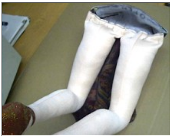
Legs pinned on, knees to chest. bottom.

19) Now, pin the legs tops all along the lower front edge of the body, with the knees touching the chest. (Again the front is the part with 2 waist darts.)