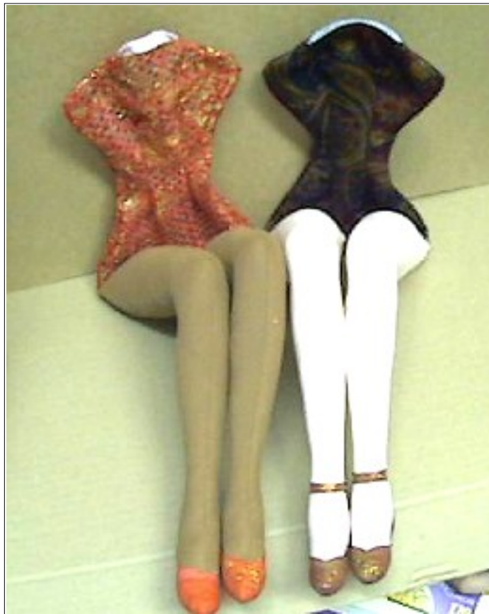
Here we are ready to have our bodies stuffed. Check out those gams! This is one of those dolls that looks good even unfinished!

Here they are with the back edge all sewn down. I used a small whip stitch. Note the loose area at the top of the legs. It has to be unstuffed there or your Milli' won't sit right.