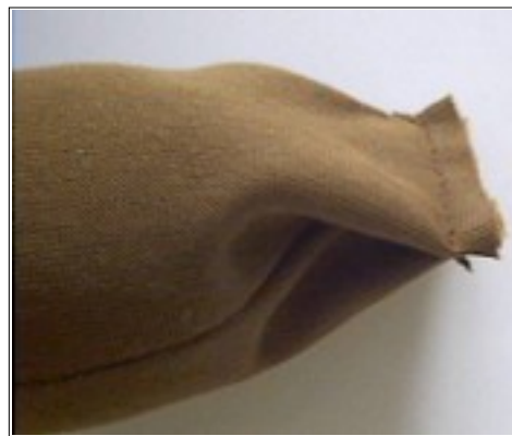
Arm top sewn across.

Personal note>>>About those mis-matched pins! Many of you are wondering why I have so many different pins! And none of those great, flower topped ones! Well, I was "willed" hundreds of thousands of pins a few years ago, and I am determined to use them up. I actually get excited when one seems dull and I can throw it away!