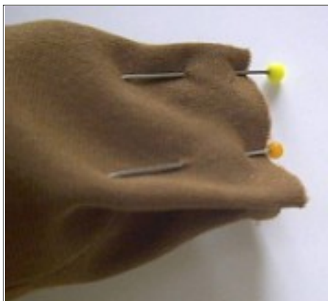
Arm top pleated in and pinned.