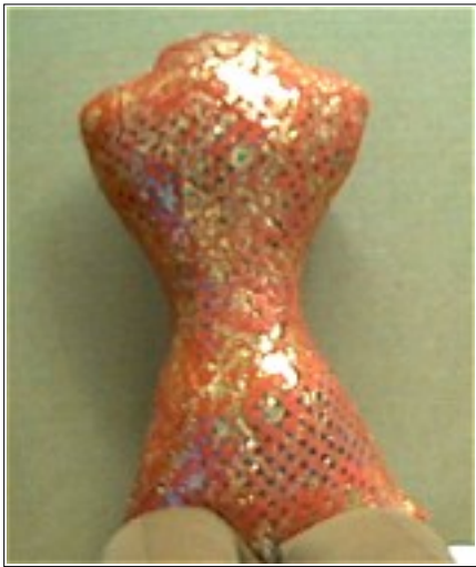
Front view of the stuffed body. *Note the curved top*

I know I am repeating myself, but I just can not stress too much the need for this body to be REALLY firm and full. There is a lot depending on it! Of course, there is a place where it is too much, like if the stitching starts to come loose!