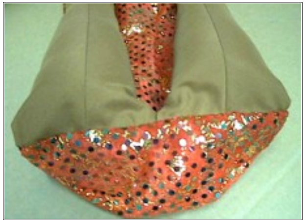
Remember the dark skinned doll with the red body that I am doing too? She's back.

Here they are with the back edge all sewn down. I used a small whip stitch. Note the loose area at the top of the legs. It has to be unstuffed there or your Milli' won't sit right.