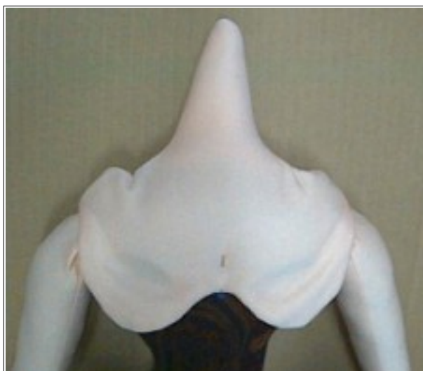
The center front pulled down and pinned.

20) Next pull the front down hard and pin it in place. NOTE>>>I haven't worried about the shoulders yet. We pull them into place last. Sometimes they need a little stuffing under them.