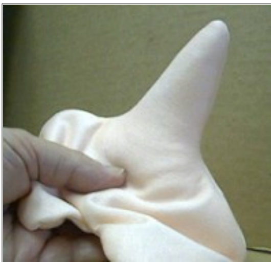
This is about how far the clay comes down.