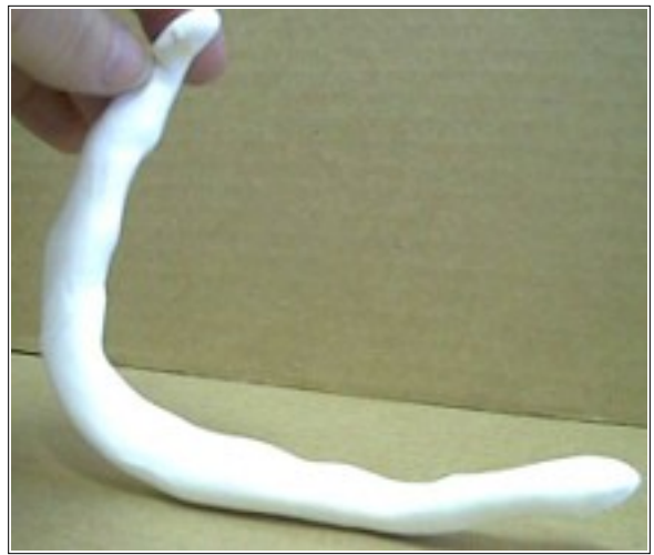
Rolled out long and skinny.

The most common question asked at this point is "Why does it have to be rolled out skinny"? Why can't I just put a blob down in the neck....With much practice I have discovered it is almost impossible to get it down in the neck all the way when you start with a blob.! The long skinny piece goes right down to the point of the neck, and then when you start mashing it, it seems to stick to the clay already there and mash down easier.