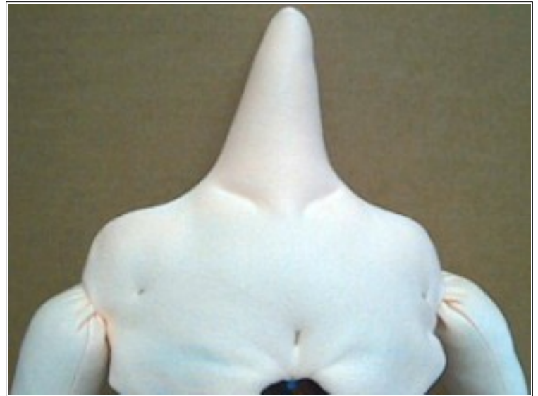
The Clavicles pressed in.