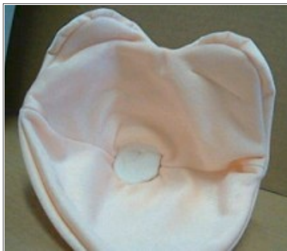
What the first clay insertion looks like from inside.

17) Now take another cotton ball sized piece of clay and press it down on the clay already in the neck. You won't need to roll it out this time.