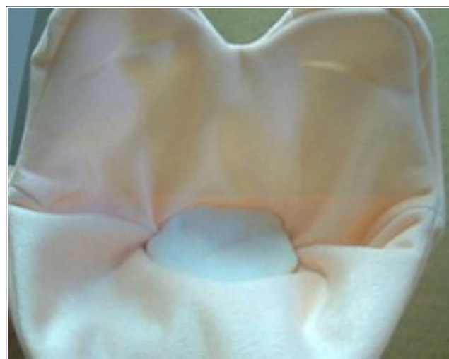
The view from inside.

18) Repeat once more, til the clay makes a nice oval, reaching to just below where the clavicles are on a neck. NOTE>>>The oval goes from side to side, not front to back.