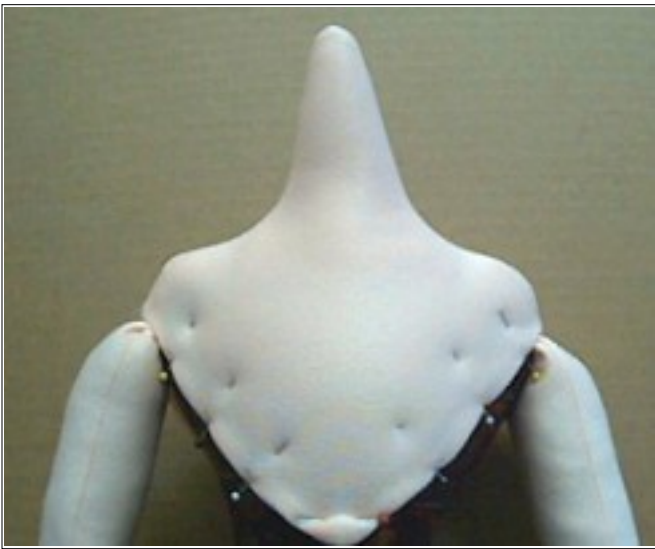
A few more pins added to the back.

You may want to check on the clavicles a time or 2 while the neck is drying to be sure they have stayed in. Let this dry now for at least 12 hours before you sew the shoulder plate down and then we will stuff the boobs, I promise!