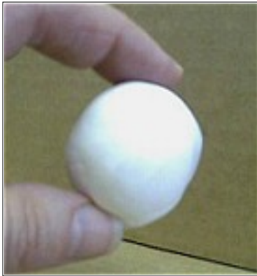
The ball of MODEL MAGIC clay.