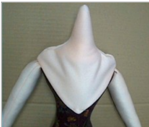
The center back pulled down and pinned without the fleece.

20) Next pull the front down hard and pin it in place. NOTE>>>I haven't worried about the shoulders yet. We pull them into place last. Sometimes they need a little stuffing under them.