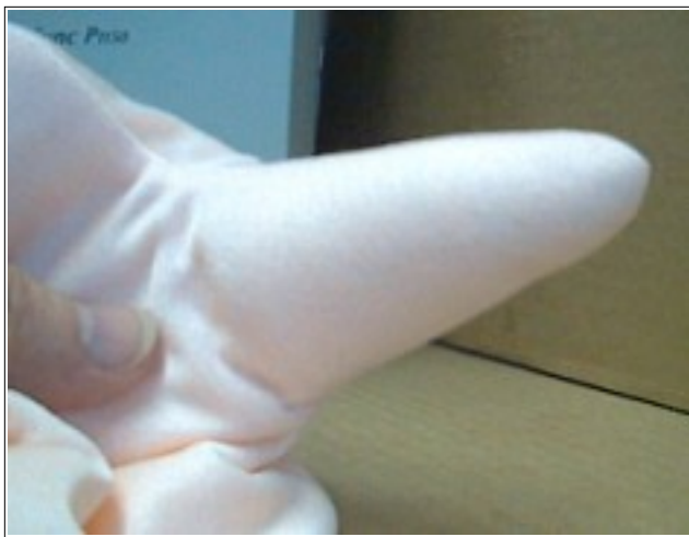
What the neck should look like with the first clay insertion pressed down inside.