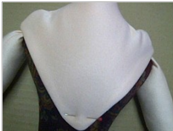
The back pinned down, with the fleece under it.