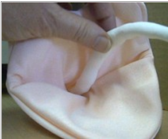
The clay going into the neck opening.

Another thing...Pull the inner fabric out smoothly as you press the clay into place. The fabric will want to pull to the inside as you press the clay down.