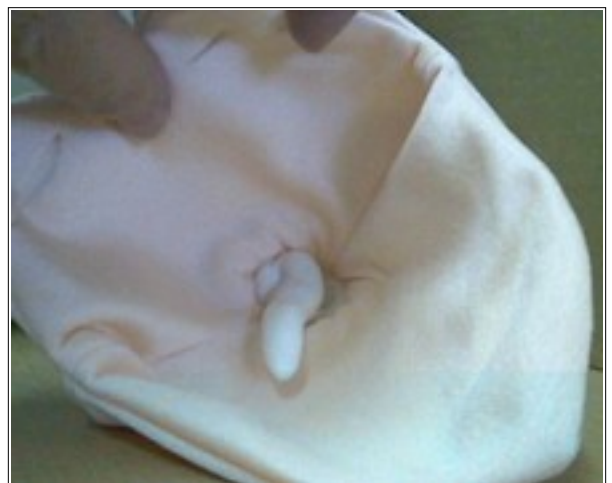
The clay being folded over on itself and pressed down into the neck.

Looks weird again! Sorry. Kind of like a snake coming out.