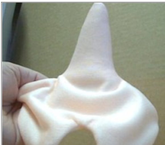
The neck after the second ball of clay is pressed down.

NOTE>>>> Be sure to pull on the lining fabric each time you press the clay down so you don't shove the lining up inside the neck, or have it all wrinkled up inside.