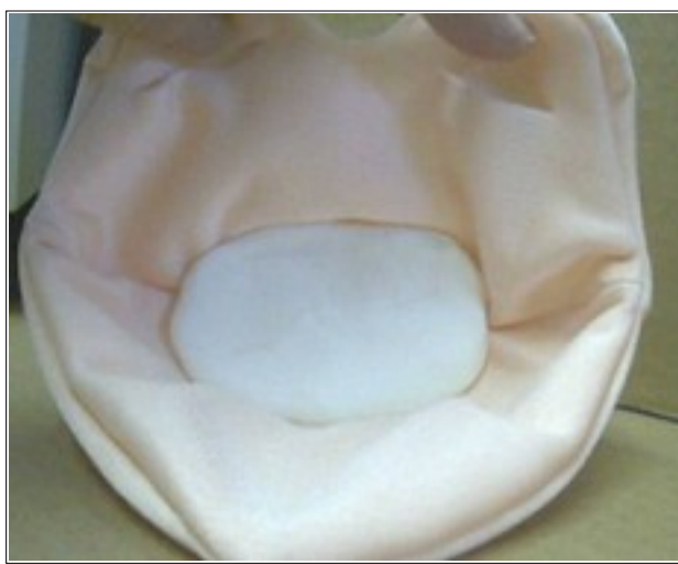
The view from inside.

Now we are going to pull the shoulder plate down on the body and pin it firmly in place, press in the clavicles and let it dry overnight before sewing the shoulder plate to the body.