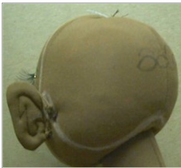
The back drawn along. There are those test eye shapes again!

Before we get those felting needles a-goin' here is the politically correct