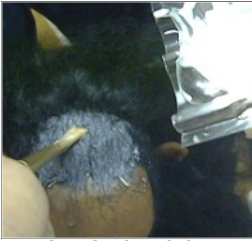
Brushing the thinned glue on.