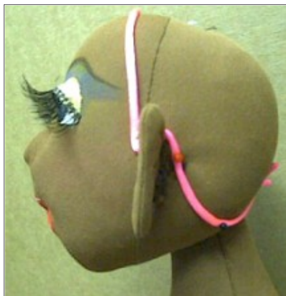
The ribbon pinned at the sides and around to the back.

NOTE***I wouldn't usually be doing the hair after the eyelashes, but remember this little head got ahead of us sometime back in the class. She is on the body now too...but...She could come off and be replaced by another head!!! Who knows!?