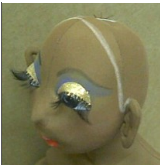
The ribbon is removed. The front is drawn along.