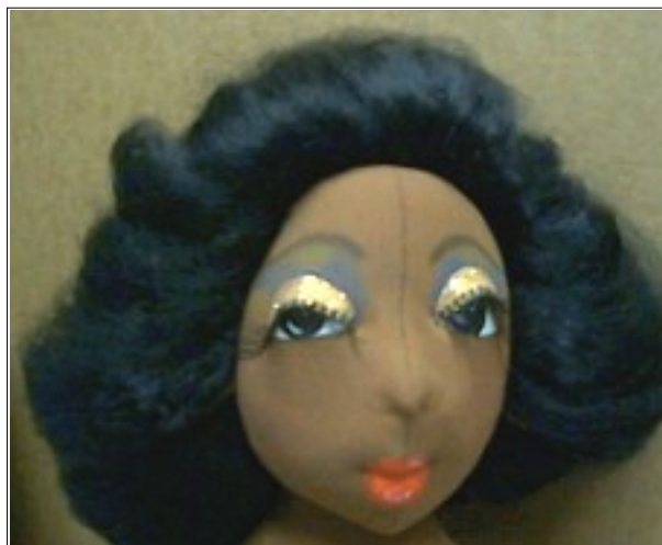
It is much better now. The hair is "sorta" bent to the center in this photo. Not styled yet though.

I have also decided that her hair is thick enough and I don't need to add any more for the upswept hairdo. I had a piece about 8" long left on the wefting. If you decide to use all of your hair, do keep out a few long, curly tendrils for the face framing tendrils we will do later. You don't need much, a couple of little "pinches" will do. Pick some real curly parts. 13. Now, let's put the hair back over her face and brush the glue over the felting. Thin tacky glue to about the consistency of cream...or...use ordinary Elmers glue. It is already thinner. Let the glue dry before doing the "rat". Directions for which will follow.