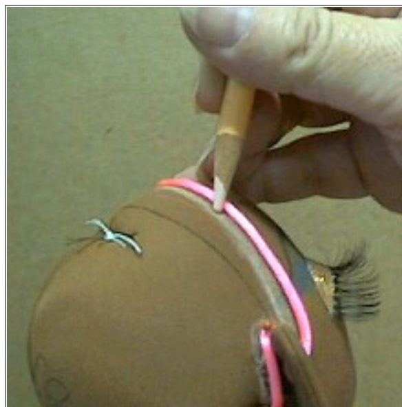
Drawing with a colored pencil.

The reason you draw ABOVE the ribbon is because if you draw below the ribbon, there is a huge chance for the hair to be too far down on the forehead.