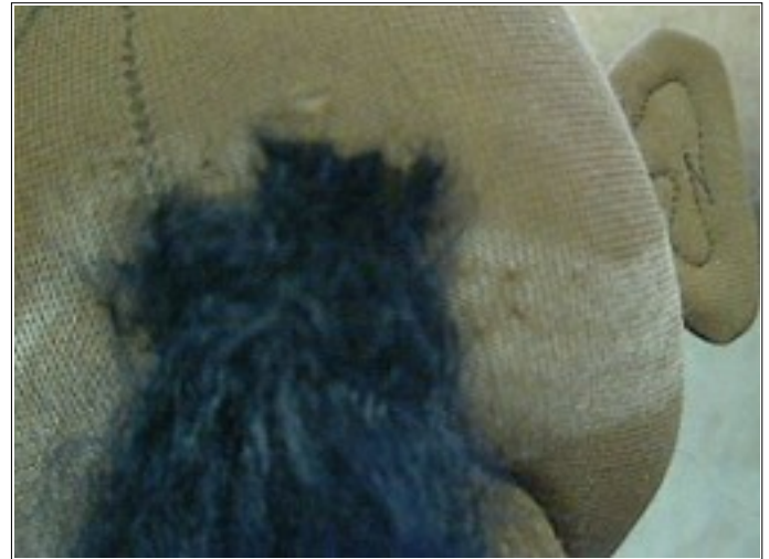
Note how matted the hair looks when it is felted in tightly.

10. Repeat all the way around, a section at a time, to the center back again. Be sure to save all those little short hairs. We will need them later.