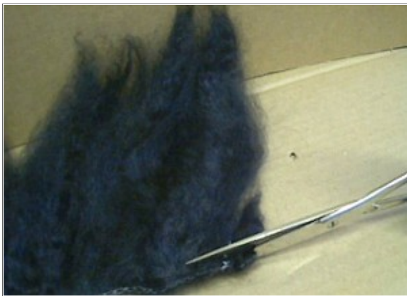
Cut a section about 1" long off.

7. Pull the little short hairs off and set them aside.