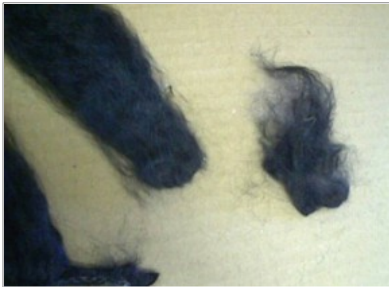
The wefting, the section that was cut off and the little short hairs.

Now let's "felt" that first section into the head.