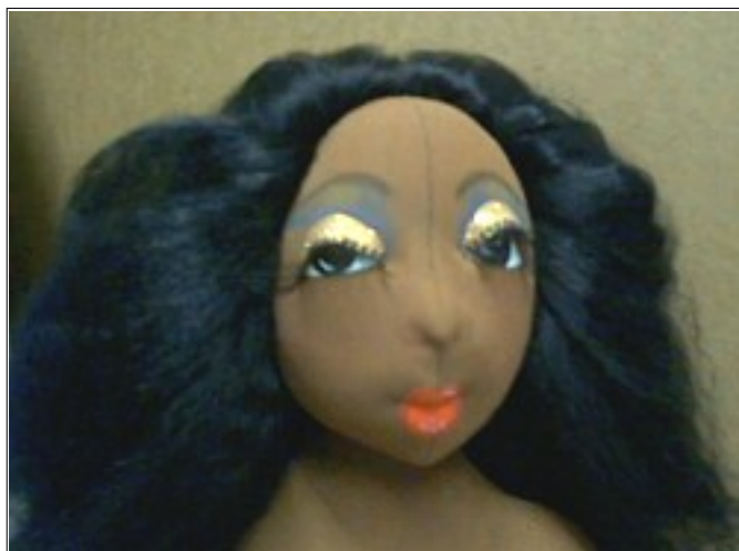
The hairline too high in front. The hair is left loose here.

Now, gently pull the hair back and look at your doll....Does the hairline need to come down more on the forehead? If so, put the hair back over her face and needle felt at the center of the forehead making the hairline a little farther down on the forehead (A widows peak?) I wanted my dolls hairline a little farther down.