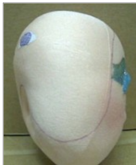
The side, and up to the back hairline. This hairline covers the ear area.

2. If you don't feel confident just marking the hairline freehand, you can use a narrow ribbon to plan the hairline, and then mark ABOVE the ribbon.