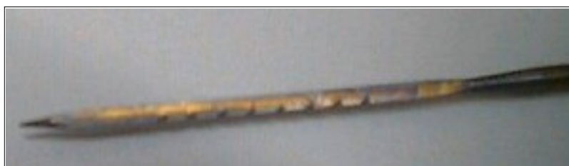
A close up showing the barbs on the needle shaft.

The top one is good. The middle one is bent, but still usable til it breaks. The bottom one is broken off. I wanted you all to realize that the needles won't last forever. Mine hardly last till lunch!