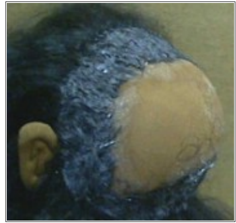
The glue on all around.

Now, go have a cup of coffee or tea and a snack while the glue dries.