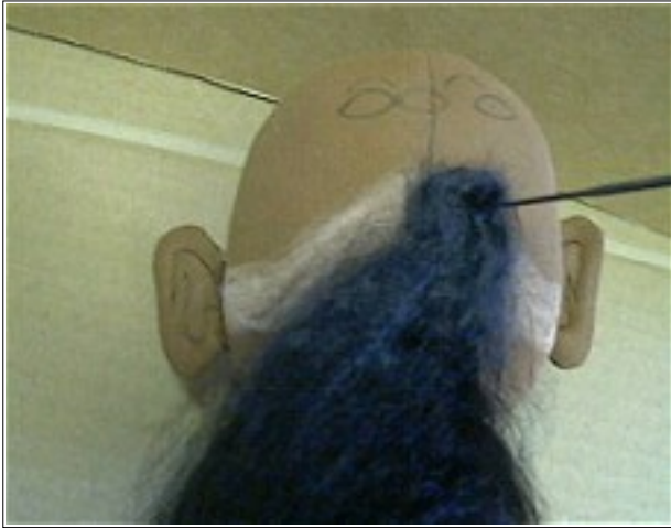
The hair laid over the colored part and the needle pushed in to start the application.

NOTE***Some hair may go into the neck too, so turn the head a little to pull it off of the neck. This actually helps, as it pulls the hair in a little farther.