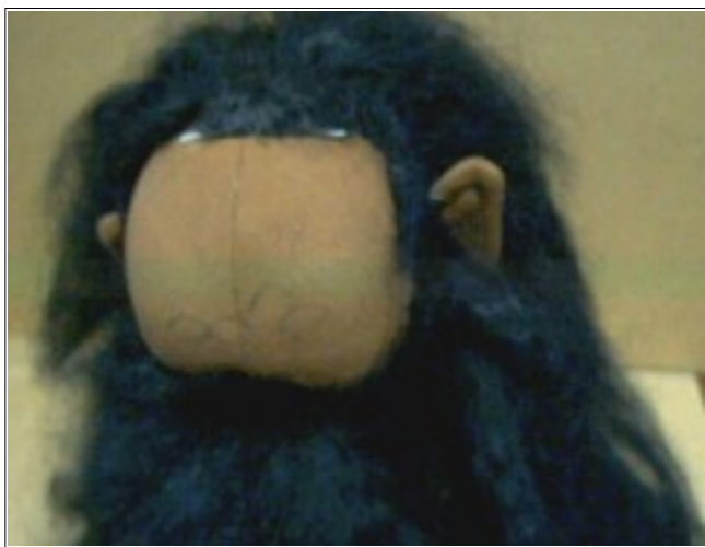
The hair hanging all around.