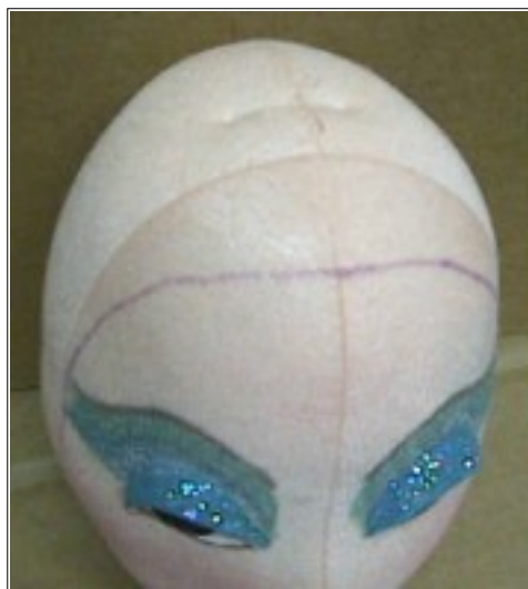
The front hairline.

By the way, I didn't like the gel pen over paint for eyes. Too muted.