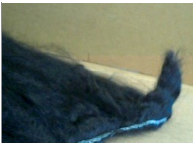
See those little short hairs? We want those kept to cover the "rat".

Now look really closely at your strip of mohair. One side will have little short hairs near the wefting. After you cut the wefting off, I want you to pull the little short hairs off, and set them aside. In the picture below, I have lifted some of the matted short hair up so you can see about how long it is. It is about 1 1/2 " long and very uneven on my piece of mohair.