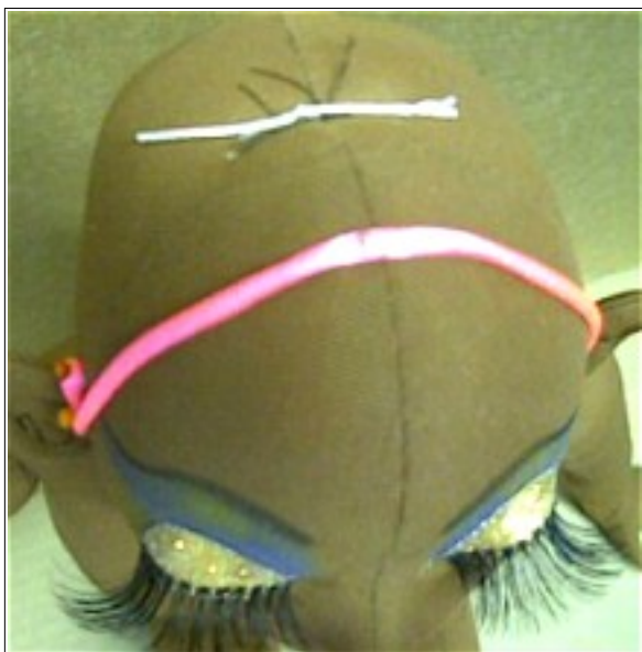
The ribbon pinned in front.