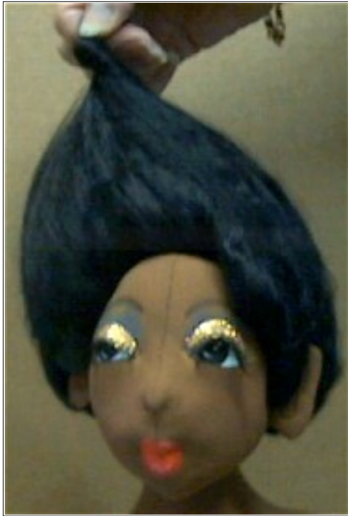
The twist. Twist til the hair twists back on itself some.

This can get addicting!!! CAUTION***If you are a perfectionist where hair is concerned, "an every hair in place person", you will have to give up at some point soon, and go with the look you have achieved. Mohair simply doesn't work for "every hair in place" hairdos.