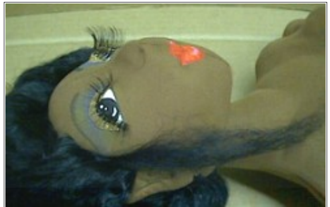
The swatch pushed into and felted into the hairline. Be sure to felt it right into the hairline, not where it is laying in the first picture.