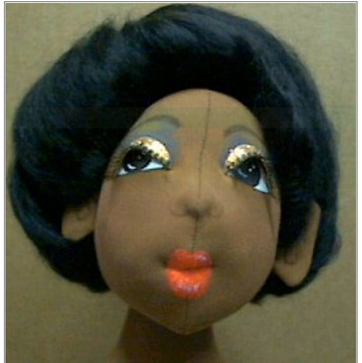
This is too uneven for my liking.