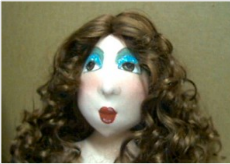
All glued on. A little plain looking? Of course, she has no eyelashes yet either .