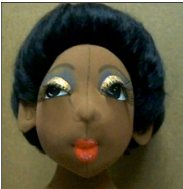
Quite symmetrical. A little prim?