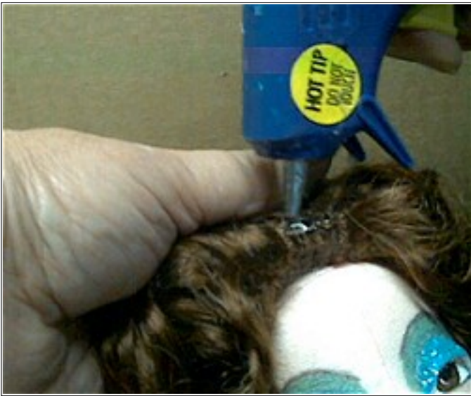
Gluing in the center.

Be sure to cover the hairline marks that you drew.