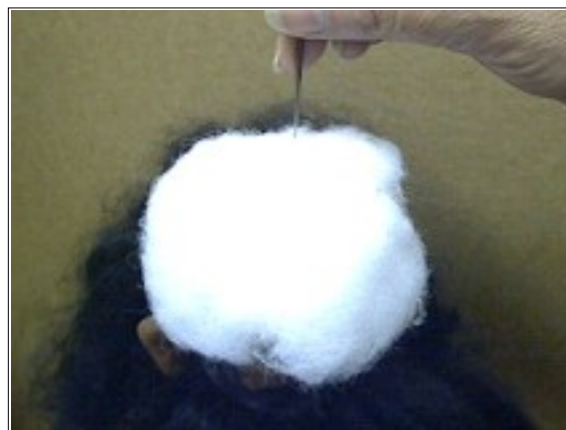
Starting to "felt" the wad into the head.