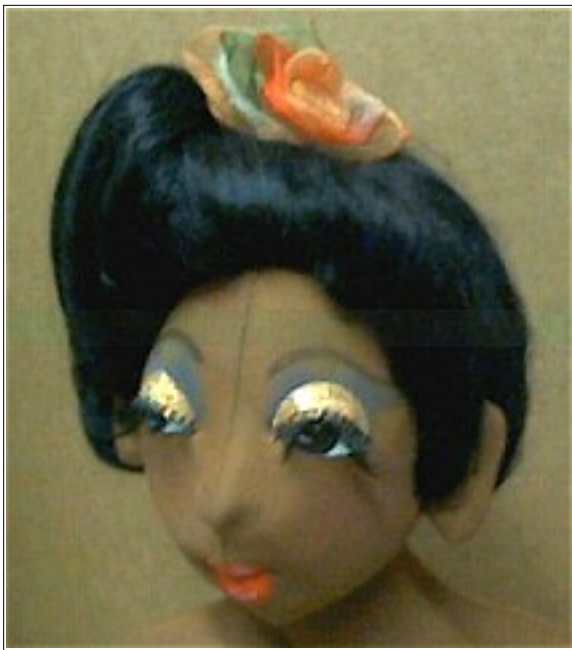
Planned asymmetry. The twist was done slightly to the side.