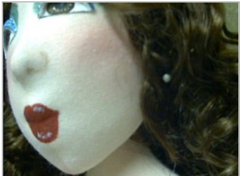
One side pinned down. See how low it is? All of the marks for the hairline need to be covered.