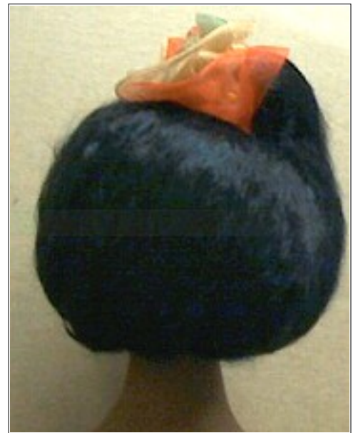
From the back. The "rose" put to use again.

I am going to "go with" this asymmetrical hairdo for this Milli'. (Now I have to make a red rose or 2 or 3) Hope I remember how!