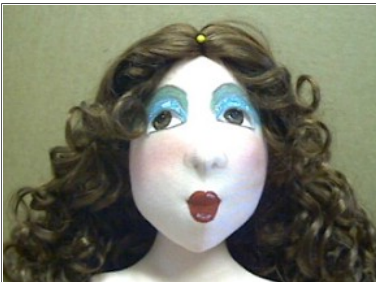
The front pinned down.