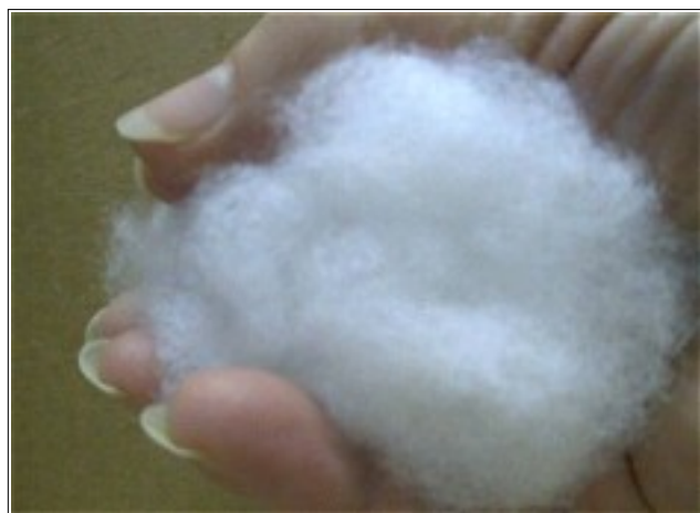
A wad of stuffing. I have compressed it some already.