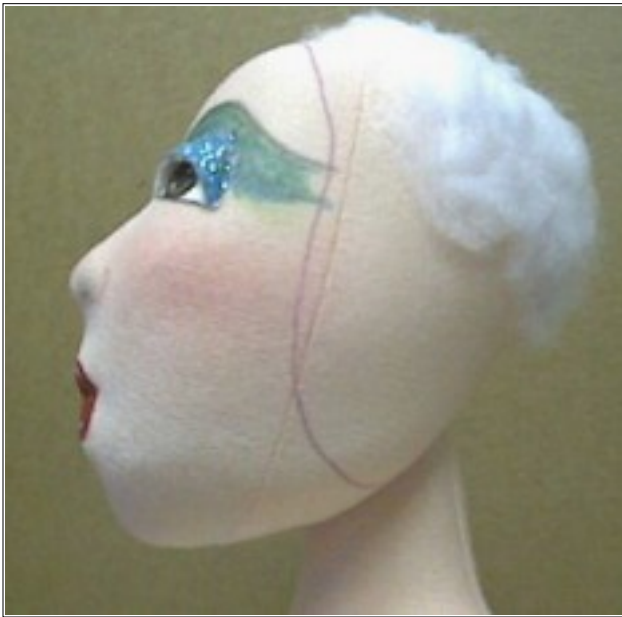
Remember this head? The Rat is on.

The wig I will demo on is a loose, long curl wig with a center part. When I took it out of the bag, I shook it really hard to loosen the curls more, and took the silly pink bows out. The wig I am using is a 12" WTA2 from Tallina's doll supply. (Address at the beginning of the class.)