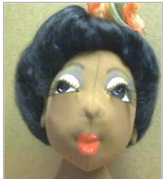
Nice flat ears. Nice lobes for ear rings too.