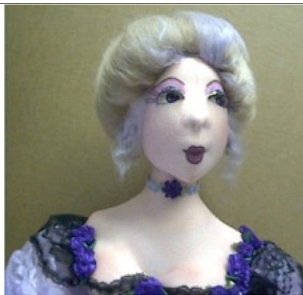
And, isn't she lovely?