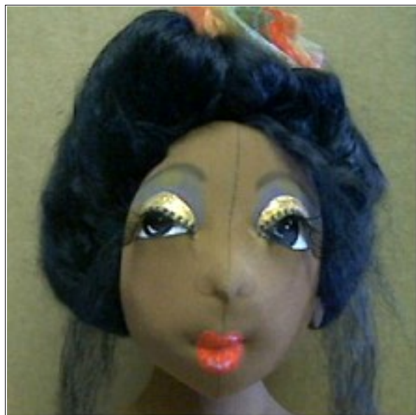
Isn't she lovely?

Following are 2 pictures. One is of the doll we have been working on and the other is of another doll that I did a two-tone hairdo on. Her hair is blond and I felted in lavender tendrils. I left some hanging down and needle combed some back into her hair too. Love the "look"!