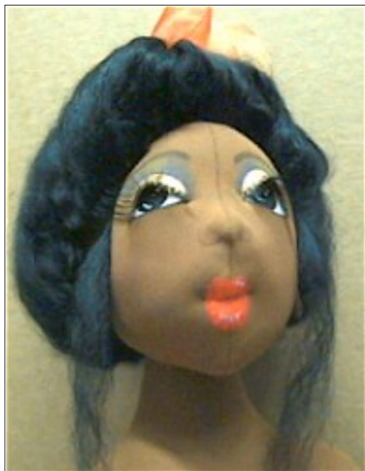
Both sides felted into the hairline.