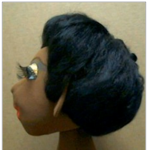
The side view.