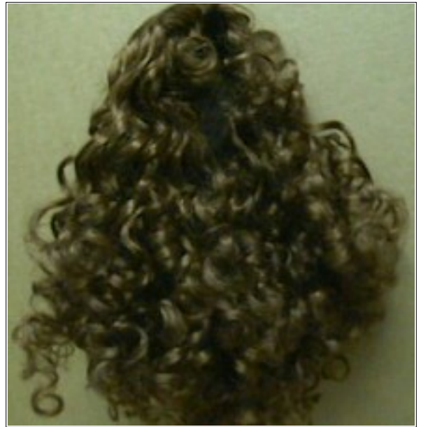
The wig, shaken out.