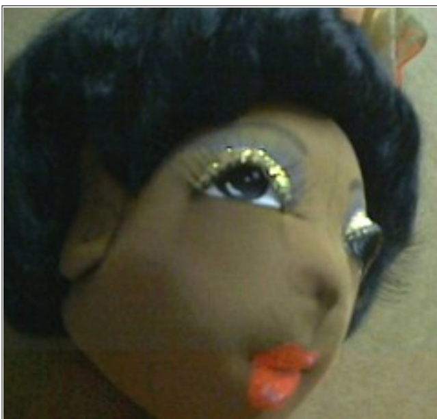
Her ear glued back.

7. Now, glue her ears back. I put a little dab of hot glue (about the size of a big pin head) right in the center/back of the ear, and press it down with my finger. Only glue the center, not around the edges. By pressing in the center, the part of a real ear that sticks out will stick out on your doll too.