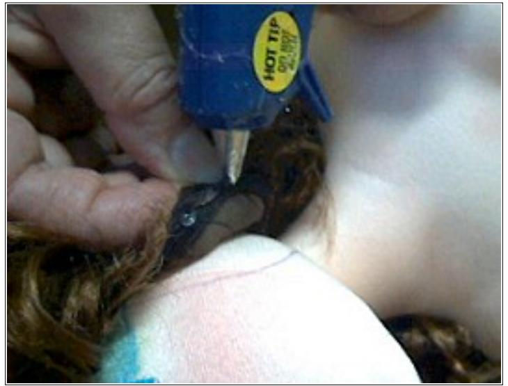
Gluing by the jaw line.