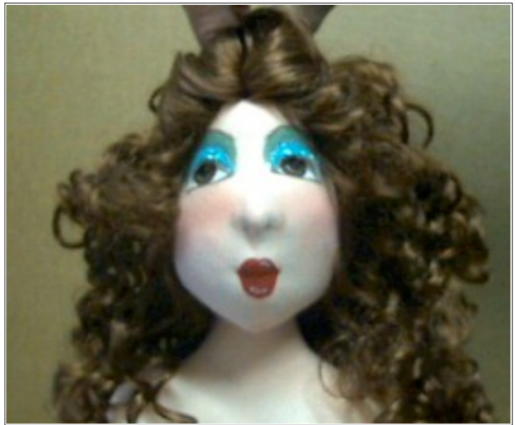
How about a little lift. Ahhh, Yes, I like that. The curly, messy "look". I will neaten the pulled up part some and tie it in with strong cord.