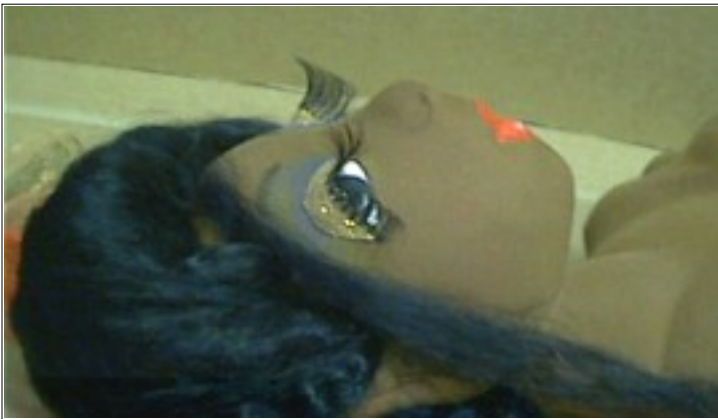
The swatch laid in place.

Use the little swatches of hair you saved, or cut off a bit of the extra hair you have left over. Lay the little swatch along the side of the head, right where the hairline is. The picture will tell it better. Needle felt the swatch right into the hairline, pulling the little swatch into the head to about the top of the ear level. Repeat for the other side. You may want some at the back too, or farther up on the forehead. It is your choice and it is so easy to do.