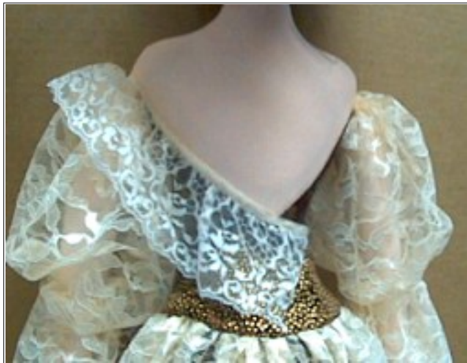
Sew or glue the lace trim along the edge. Note the overhang of the lace at the middle.

Lay the edge of the lace right along the edge of the shoulder plate, working up to the top of the shoulder and over the shoulder to the front. Glue or sew it down as you go.