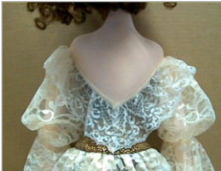
The lace sewn or glued down the back. The end cut at an angle.

About now many are thinking we are NEVER going to get those boobs covered!!!