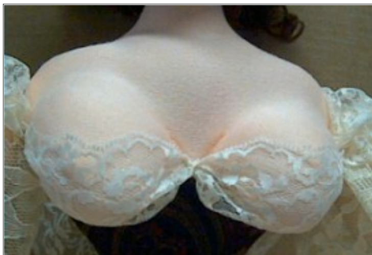
The boobs are finally covered, though not very modestly!

9) Time for trimming...finally...First, I like to gather up the center back of the lace trim and secure it.