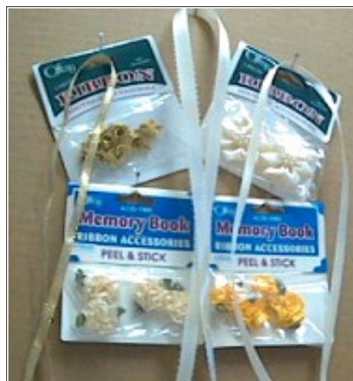
Some flowers and ribbons.

I have some on several of the other dolls that have been pictured here and there in the class.