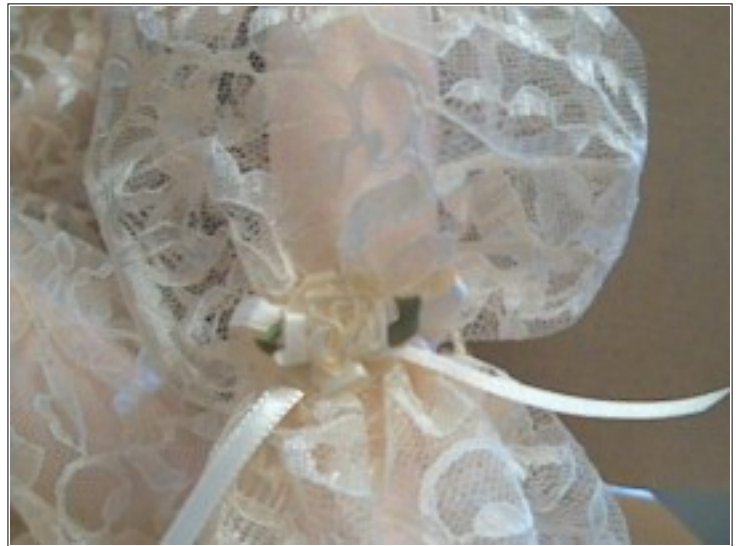
A simple ribbon bow and flower on the sleeve.