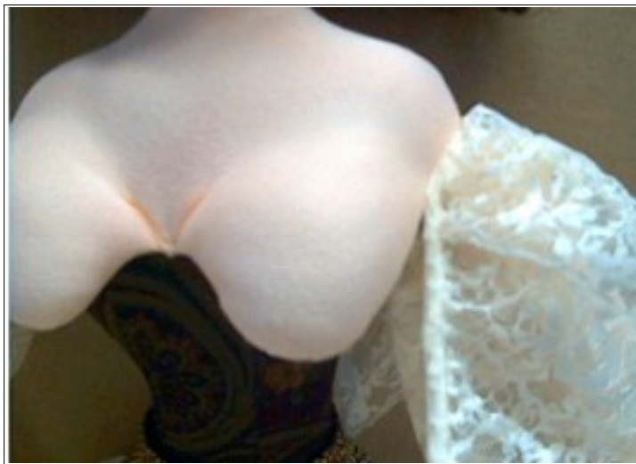
The gluing or sewing stops here for this side. DO NOT cut the lace off yet!!!!

4. Now trim the first back edge of the lace at an angle.