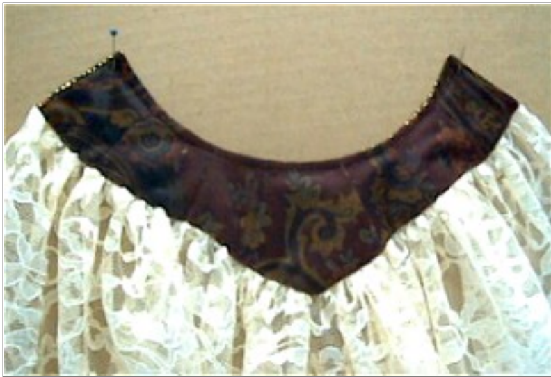
The lining hand sewn down.