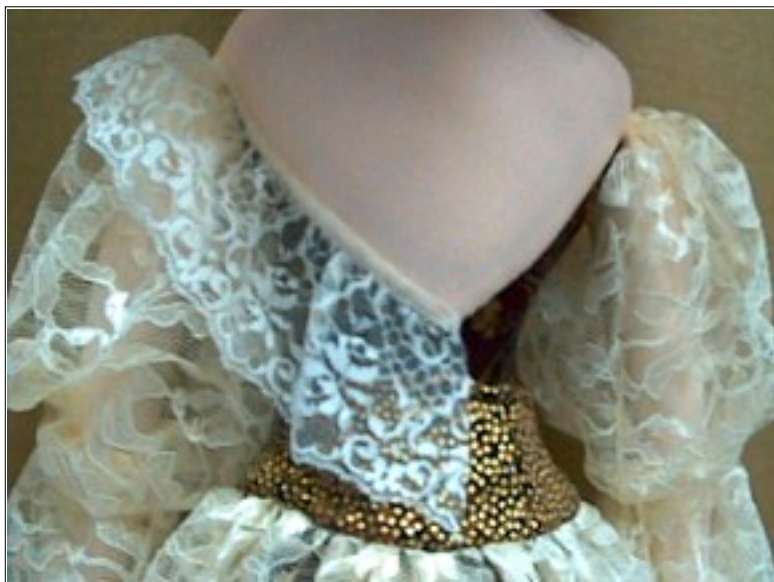
Trim the first back edge of the lace at an angle.

4. Now trim the first back edge of the lace at an angle.