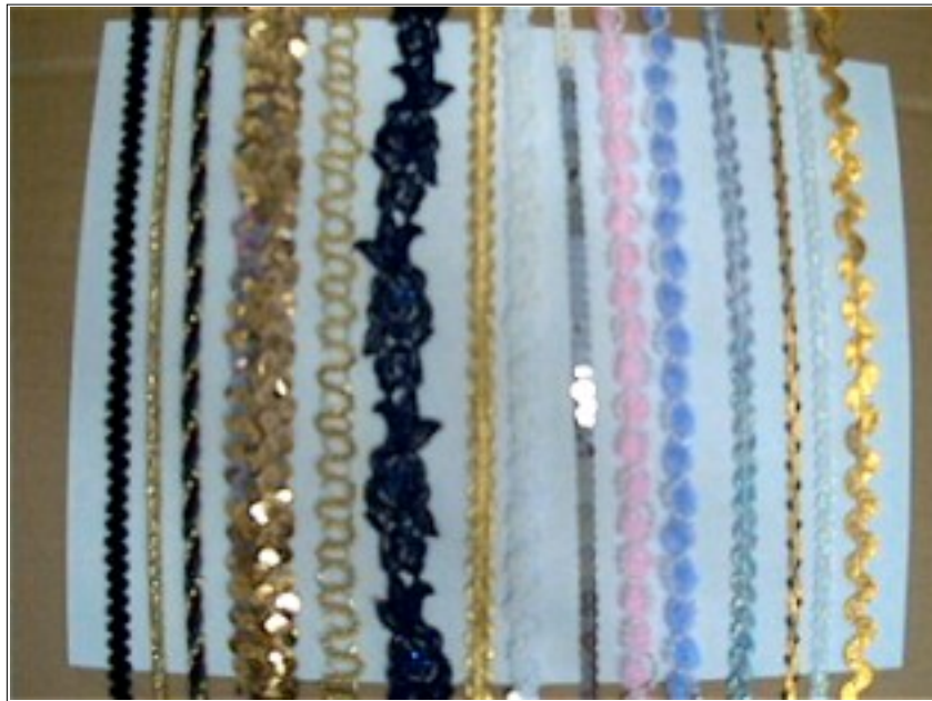
"Stuff" that makes good trim over the lace.

Lets look at some trims that are suitable for putting over the edge of the lace. The ones I am picturing are not necessarily for this doll. They are just to give you an idea of things that look nice over the edge of the lace. I am sure you all have a stash, just full of pretty "stuff" that you can use. I am going to use the gold braid in the middle.