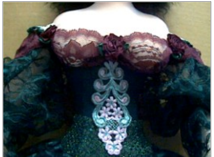
A dyed appliqué on a doll.