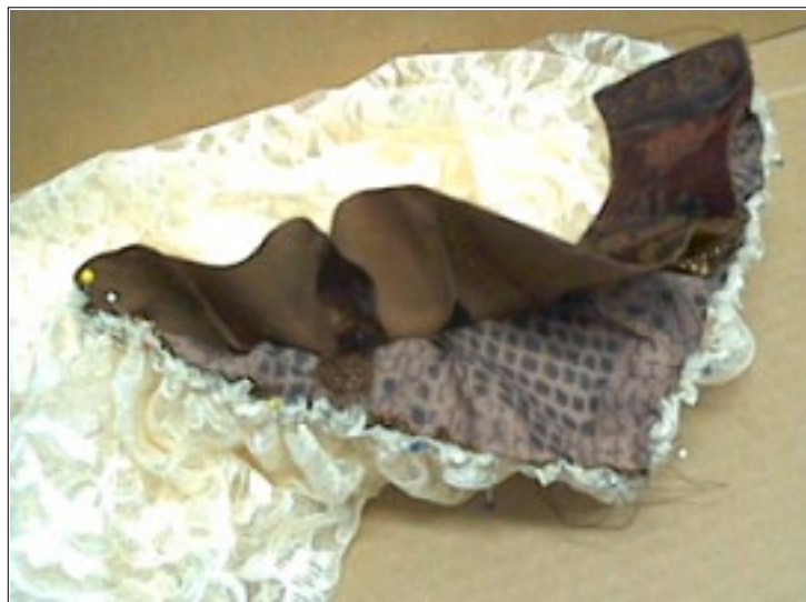
The skirt pinned to the outer yoke. Note the lining is still free.

15) Right sides together, fit, pin and sew the skirt onto the OUTER yoke (not the lining) folding about 1" of the lace towards you on each end, so the back opening has a nice finish. Arrange the gathers as evenly as possible as you are fitting, pinning and sewing.