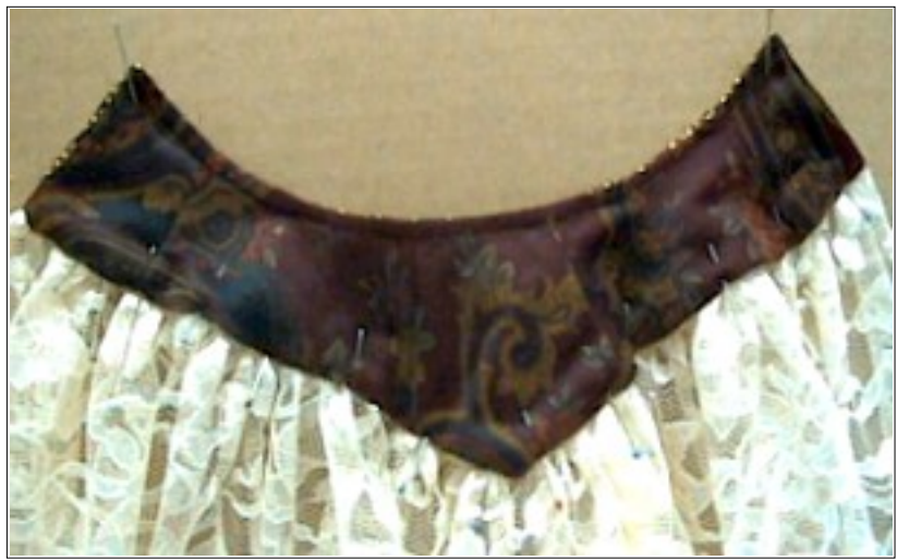
The lining pinned down.