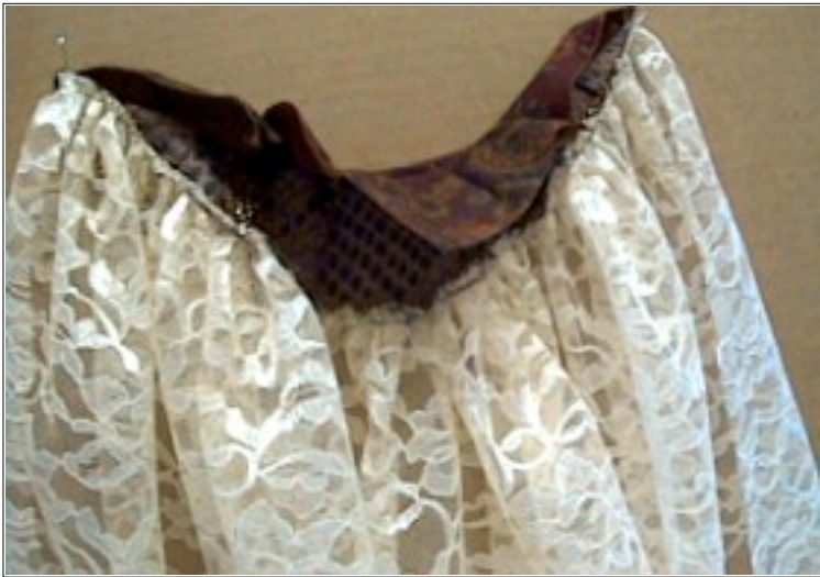
The lace sewn to the outer yoke.