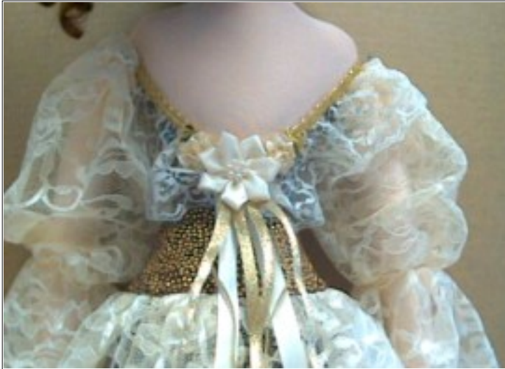
Streamers and flowers in back.