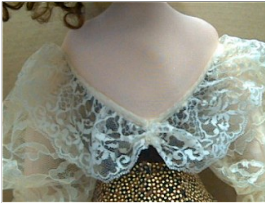
The center back of the lace gathered up and sewn in place.

Lets look at some trims that are suitable for putting over the edge of the lace. The ones I am picturing are not necessarily for this doll. They are just to give you an idea of things that look nice over the edge of the lace. I am sure you all have a stash, just full of pretty "stuff" that you can use. I am going to use the gold braid in the middle.