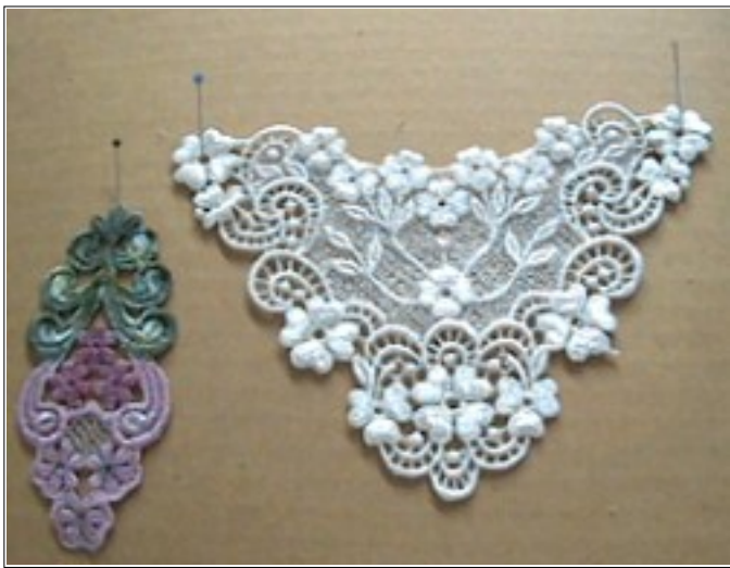
A dyed appliqué and a cream appliqué.