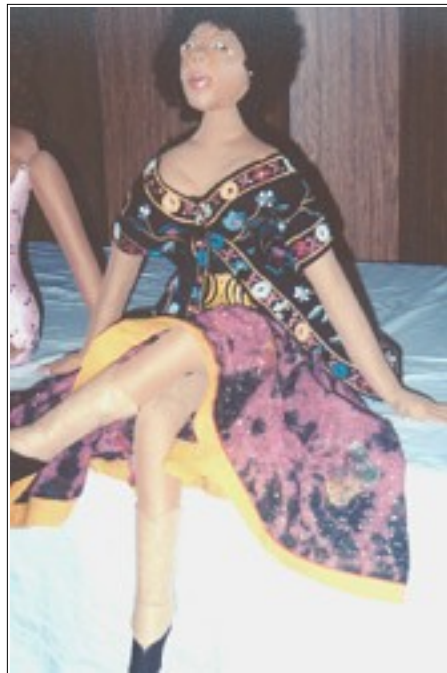
A Bohemian look achieved by using an old skirt, a vest front, and making "boot tops" for a regular Milli' doll.

Go to... ~ Classroom ~ Black Board ~ Pattern ~