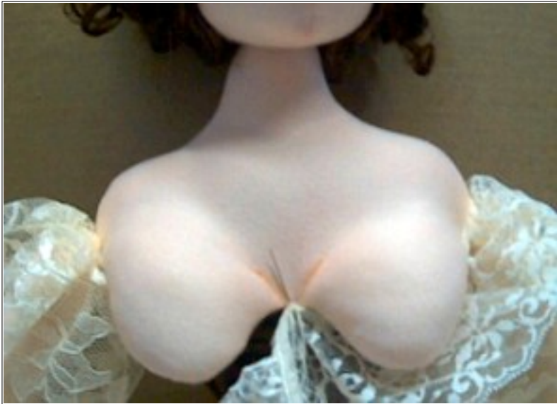
The lace UNDER the boob and stitched in the middle.