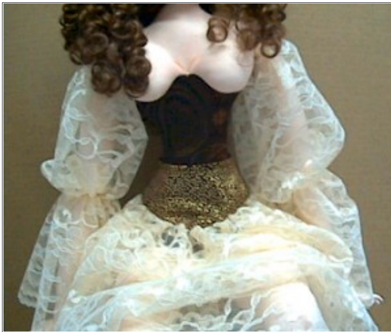
The skirt is on.