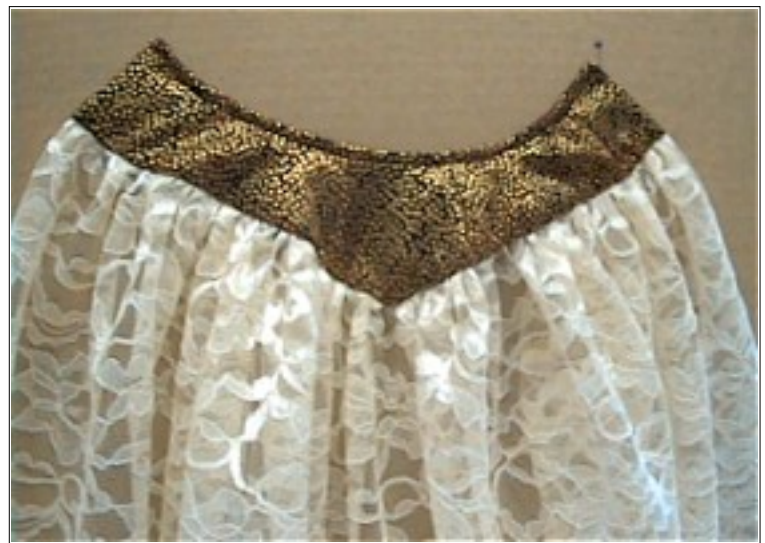
The right side. My "cool" old fabric. This fabric was from one of my skating competition costumes!

17) Sew the center back seam to within 4" of the yoke. Put the skirt on and decide whether you are going to sew it on, or put small snaps or Velcro® on the yoke, to close it. If you are really neat, you can even glue the back closed.