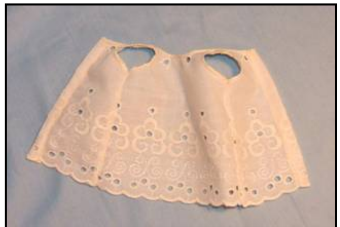
Back edges hemmed all the way. This slip will have snaps all the way down the back.