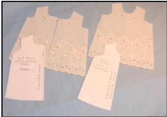
Slip cut from eyelet, with the pattern.

If the slip is open all the way down the back, you will need 3 or 4 snaps or buttons and button holes.