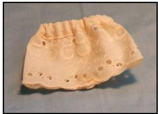
Crotch seam sewn. Turn right side out. You are done.