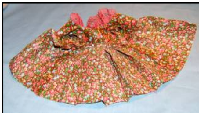
The skirt is fitted, pinned and sewn to the bodice.