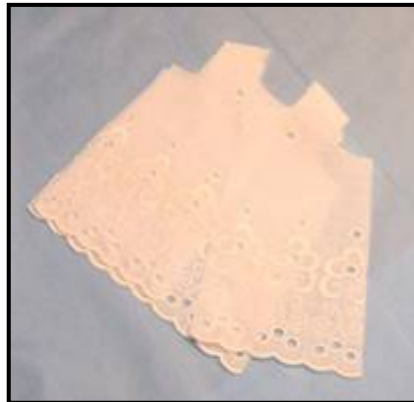
Sew shoulder seams.