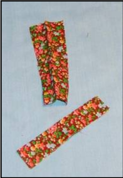
The cuffs pressed.