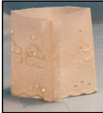
Sew the short seam.