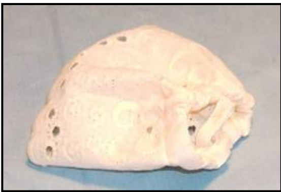
Ends of elastic sewn. Close the little opening.