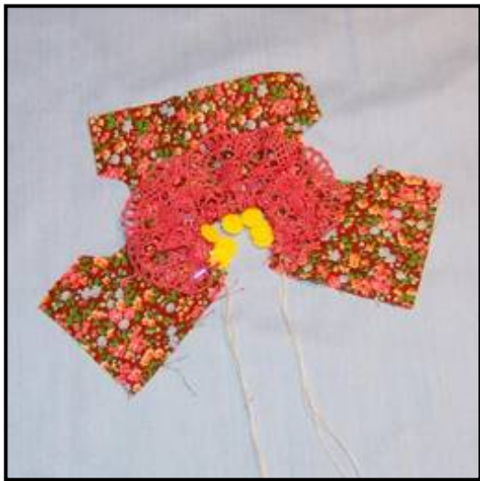
Gathered lace pinned in place.