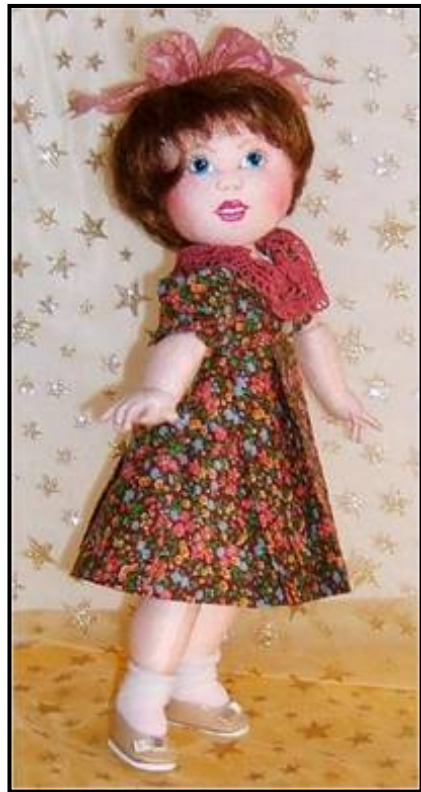
Bleuette in the dress we just made.