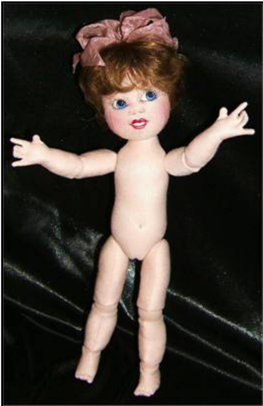
Not a stitch to wear.

The clothes here are "real" meant to have snap or button closures, and meant to be removable, so you can change your dolls clothes to your hearts content.