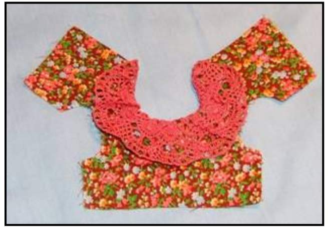
Turn right side out and press.

7. Run 2 rows of gathering stitches at the sleeve top. Pull the stitches so the sleeve fits into the armhole. Pin and sew the sleeves in place. I also like to trim this seam to about 1/8" and zig-zag over it to make it less bulky.