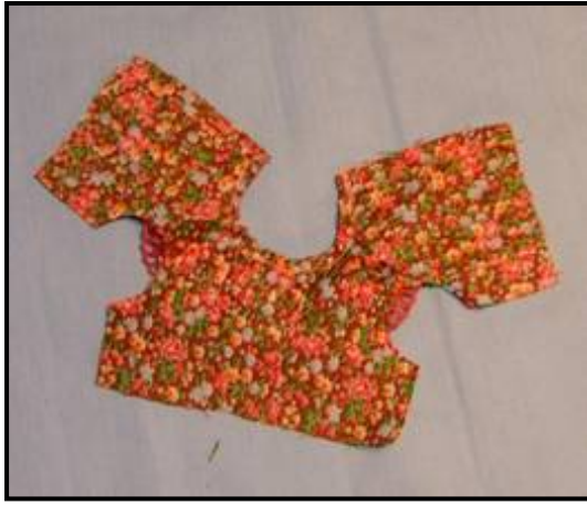
Sew the bodice and lining together. Trim and clip neck seam.