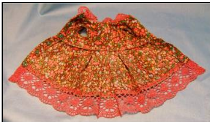
A lacy bottom edge. This picture is from the wrong side.

Another fun option for the dress is to cut off about an inch from the skirt length and sew lace to the bottom of the skirt to match the neckline lace.