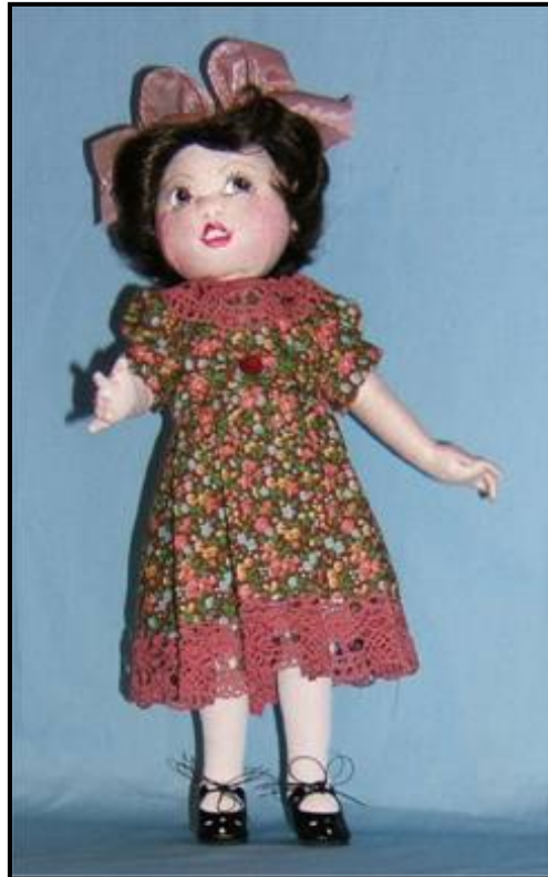
"Easy" Bleu with the detailed hands, in the lace edged dress.