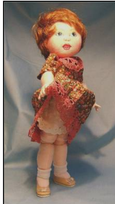
Another Bleu in the lace edged dress.

And now you are all done except to have fun making more clothes for your