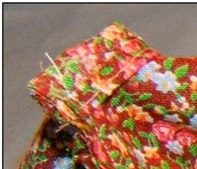
The back edge of the skirt folded BACK over the edge of the bodice about 1/2". In this picture, the diagonal, lower left, to upper right sewing you see is the back edge of the skirt. The seam in the center is the skirt being sewn to the bodice. When you pull the skirt down into place,

16. Fit, pin and sew the skirt to the bodice, folding the back edges of the skirt, back over the edge of the bodice. I hope the picture and more explanation below makes this clearer. I know many already finish the back edges of skirt/bodice assemblies this way, but some may not do it yet, and it makes the back edges so much more finished.