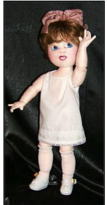
My little slip.

I have on purchased stockings that come in a roll and one just cuts off a pair as needed! They roll down so cute right above the knees. They also come from Antina's Doll Supply. I also have on purchased shoes from the same doll supply catalog.