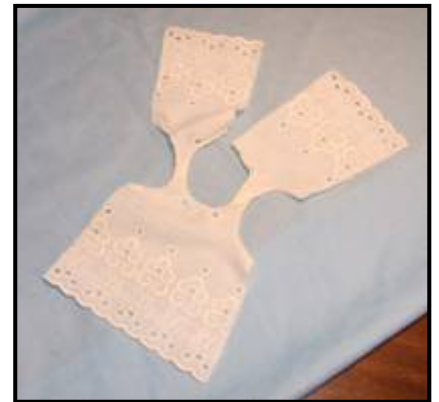
Hem neck and arm openings.