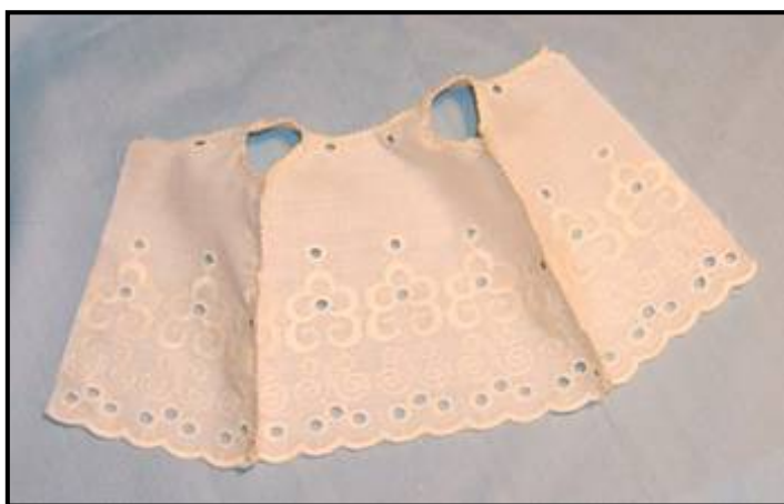
Sew side seams. I like to overcast the side seams too.