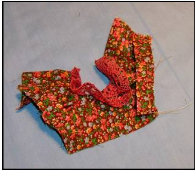
One cuff sewn to the sleeve edge. It is hard to see, but easy to do.

11. Sew the side and under arm seams of the bodice. Trim seam to 1/8" and zig-zag stitch over the seam.