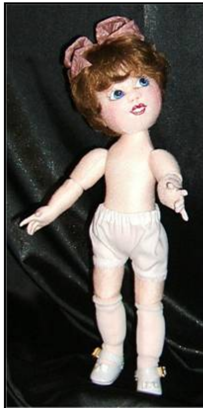
Super easy panties.