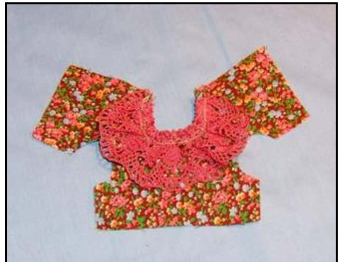
Gathered lace sewn in place.