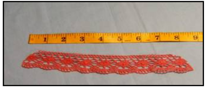
Taper the ends from the straight edge, out to the lacy edge.