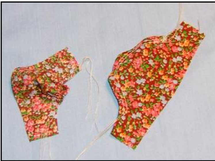
The sleeve tops gathered.

7. Run 2 rows of gathering stitches at the sleeve top. Pull the stitches so the sleeve fits into the armhole. Pin and sew the sleeves in place. I also like to trim this seam to about 1/8" and zig-zag over it to make it less bulky.