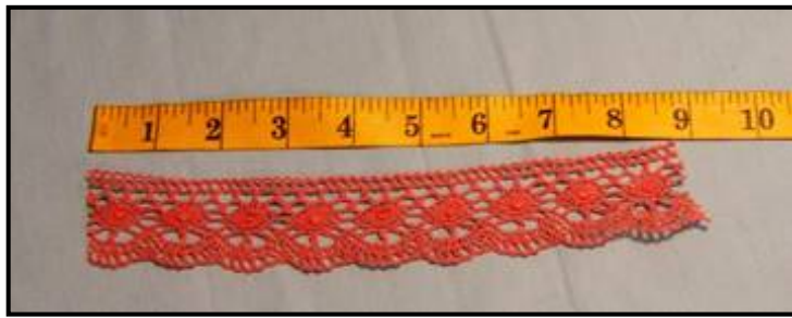
The 9" of lace.