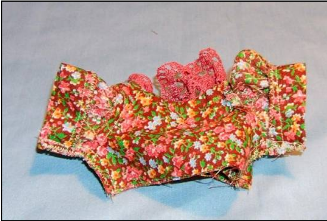
Under arm and side seams sewn. seams trimmed and a zig-zag stitch covers the raw edges.

11. Sew the side and under arm seams of the bodice. Trim seam to 1/8" and zig-zag stitch over the seam.