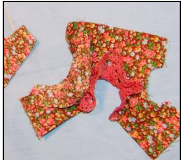
Fit, pin and sew into arm holes. One is sewn in.