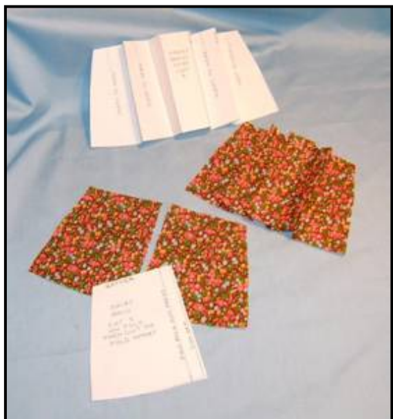
The skirt pieces with the pattern. Iron the pleats in. It helps to have the pattern folded as a guide.