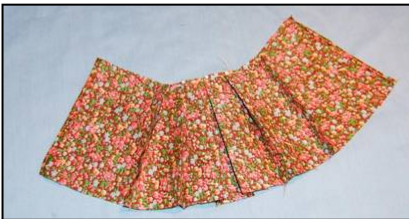
The side seams sewn, and the pleats sewn down in place. I haven't yet done the zig-zag stitch over the side seams in this picture. I have hemmed the backs narrowly.

14. Sew and gather the little gather stitched areas in the skirt backs. The pattern shows them.