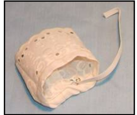
Hem the top and run elastic through.