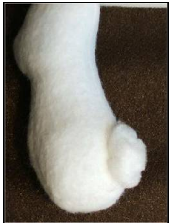
Sew the tail on.

11. Embroider the nose as a triangle, making a satin stitch from wide to narrow. Bring your needle out at the mouth corner, and then bring it across to the other side and out at the top of the nose. From the top, come out at the tip, and make a stitch straight down from the tip of the nose, to the center of the mouth. Bring the needle out at the top of the nose and sew a few more satin stitches in the nose to cover any spots you missed.