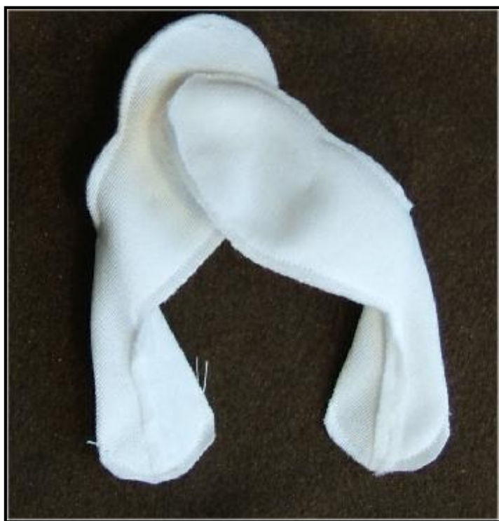
The toe templates are off and the seam is trimmed.