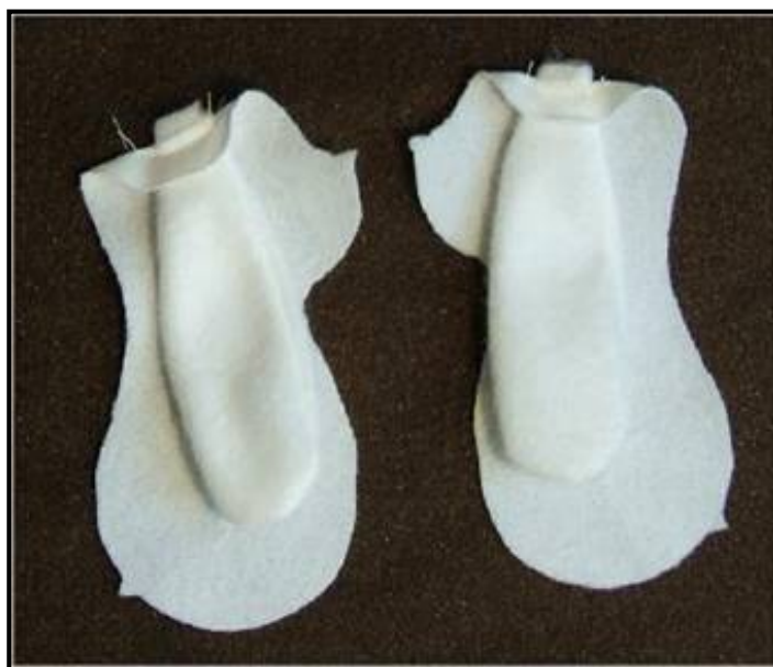
The ears sewn into the head sides.

6. Sew the body sides together from the nose triangle, over the top of the head, to the triangle at the back.