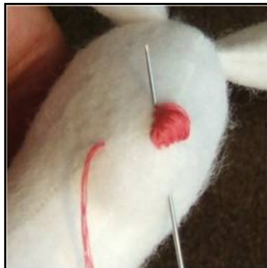
Come out at top.

12. You can also sew a line of your pink along each side of the triangle nose, to clean the sides up a bit....OR....You can paint the nose, and do only the mouth with the thread.