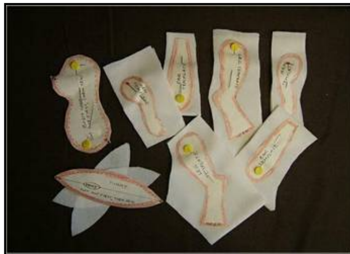
The parts for the Rabbit both cut out and cut away from each other. You will throw one tummy piece away.