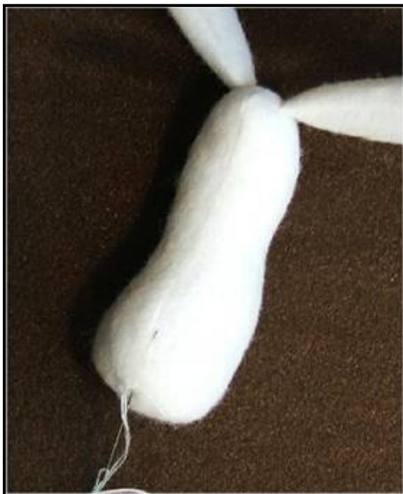
Close the opening and come out in back.

10. Sew the opening shut and bring your needle out at the lower back to sew on the tail. I have used a cotton ball here, and sewn into the body and through it several times to give it a lumpy look. This is also where you will anchor of your stitching, right under the tail.