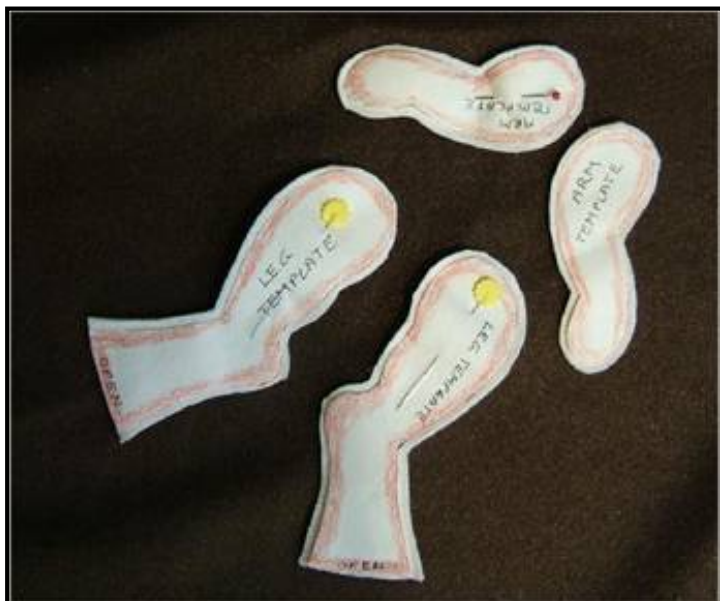
The templates sewn and cut out.