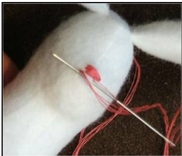
Satin stitch the nose.

Exit out at the side of the head. I like to put a coat of clear drying glue over the satin stitched nose too. Mostly, because I am a TERRIBLE embroiderer! I almost always end up with a piece of thread that is loose. Did it this time too!!!!