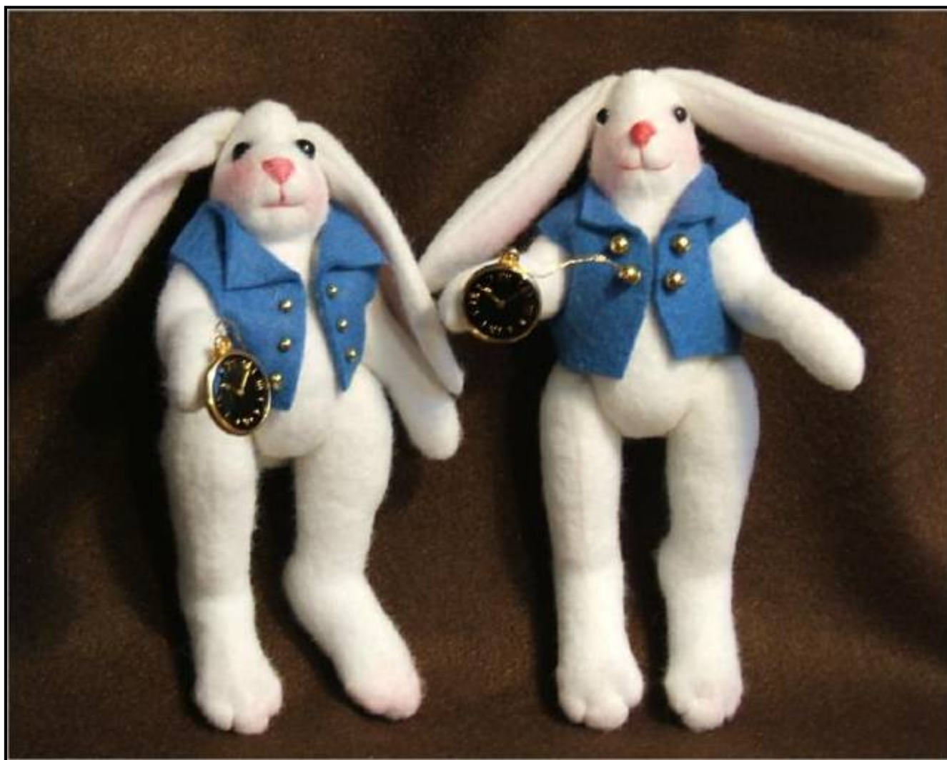
Two White Rabbits. One done with the "stretch" up and down...One with the "stretch" side to side.

19. Sew beads to the vest to simulate buttons. Sew the Clock button to the White Rabbits hand. With gold thread, sew from the clock to the button on the vest, to simulate a watch chain.