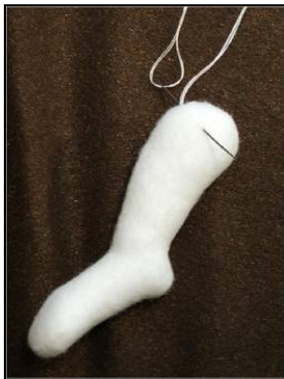
Close opening, and then come out at inner side.