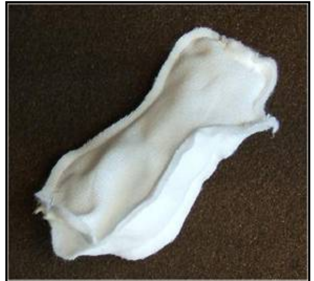
Tummy sewn in place. SEE the opening?

9. Stuff the Rabbit fully, shaping as you stuff. The Rabbit being made in this class is made with the stretch up and down, so he will be thinner.