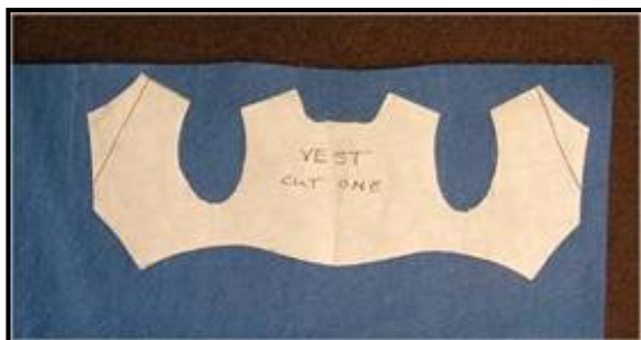
The vest ready to cut out.