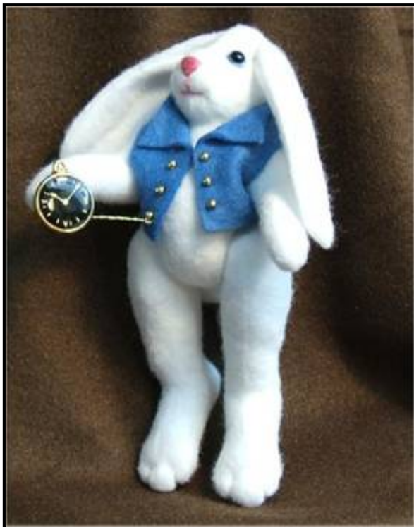
White Rabbit standing.

He is so cute and would make a good prop or toy for other dolls too.