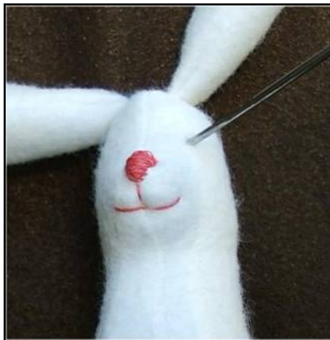
Poking and digging a hole with my big needle.