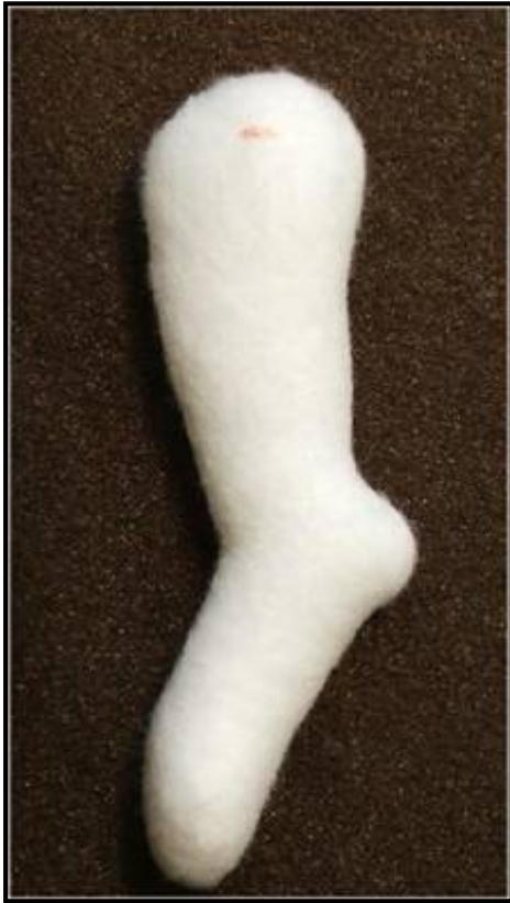
See the stitches, colored red?