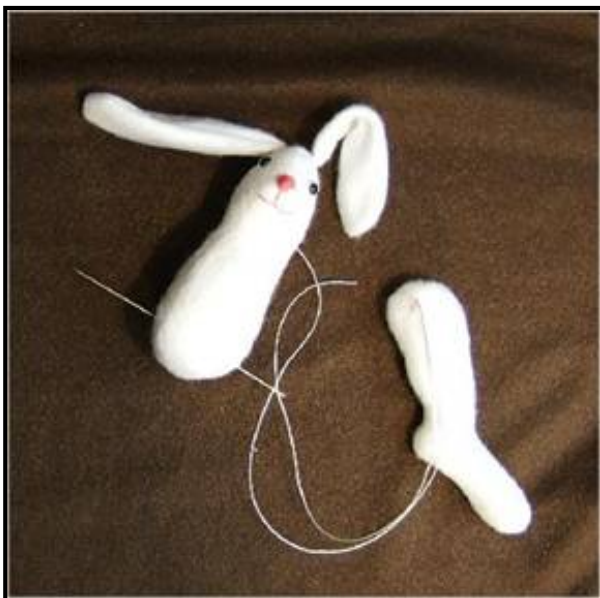
Joint your Rabbit.

18. Needle sculpt toes if desired. To do so, enter at the bottom of the foot, about half way between the side and seam. Bring your needle out and sew around a couple of time. Exit at the top of the next toe division. Sew around there a few times. To anchor off the sewing, sew back and forth, between the toe stitching several times and exit away from the stitching.