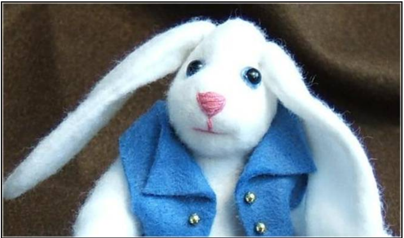
White Rabbit face, with an embroidered nose, and blue animal eyes.

I make my White Rabbits from White velour. With the stretch side to side, you will have a shorter, fatter Rabbit. With the stretch up and down, you will have a taller, slimmer Rabbit. You could also use white felt, but it would need to be lightweight felt for ease of turning....A hint for using the white Freezer Paper patterns on white fabric.... Color the edges of the pattern pieces with colored pencil so you can see the edges as you are sewing around the templates.