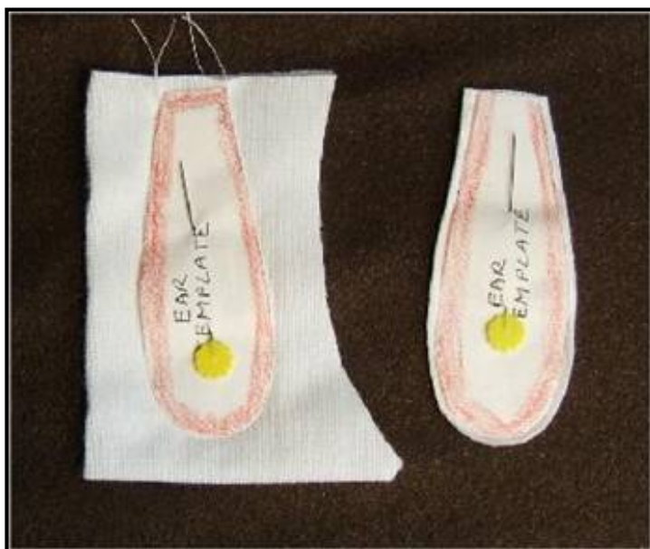
One ear sewn and the other already cut out.