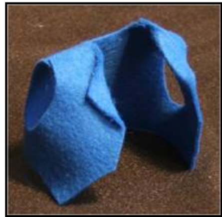
The vest glued.