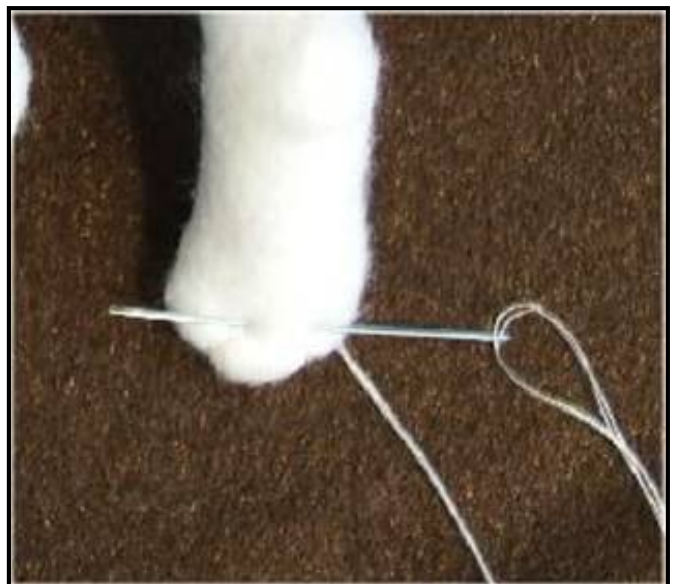
Anchor off the sculpting between the toe threads.