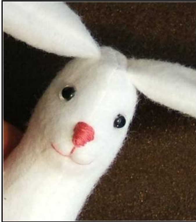
His face is on.