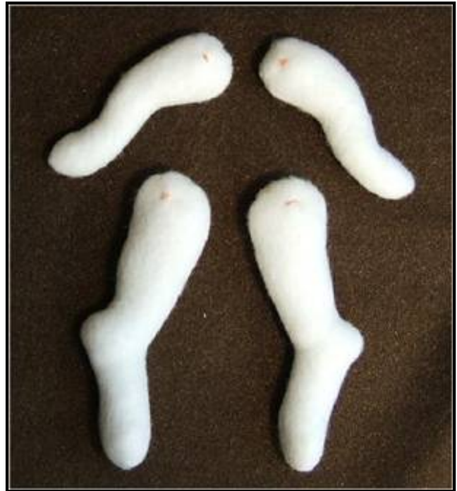
Make rights and lefts!!

17. Joint your Rabbit just like you do for dolls, except you will sew through the stitching for extra strength, rather than having a button inside.