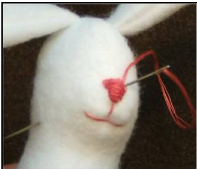
Finish up by coming out at the side of the face.

Y ou could also use beads or tiny buttons for eyes, sewing them in by going back and forth between them several times and then bringing your thread out away from the eyes.