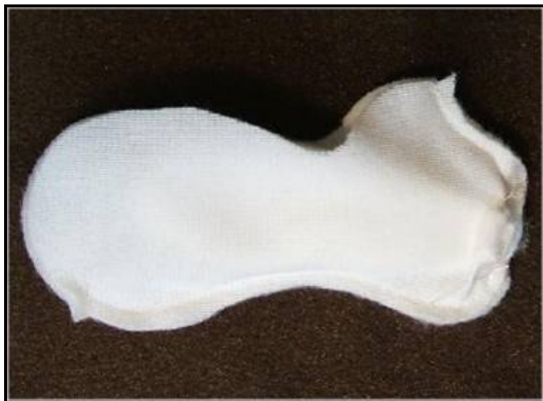
Sew the body from the nose to the bottom.

7. Fit, pin and sew the tummy in place on one side. I like to work this part from the nose to the back on one side, and then from the nose to the back on the other side. Any adjustments can be made at the bottom, back, where a tail will be.