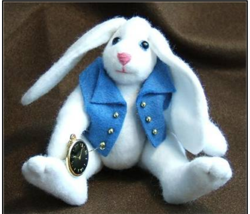
White Rabbit sitting.