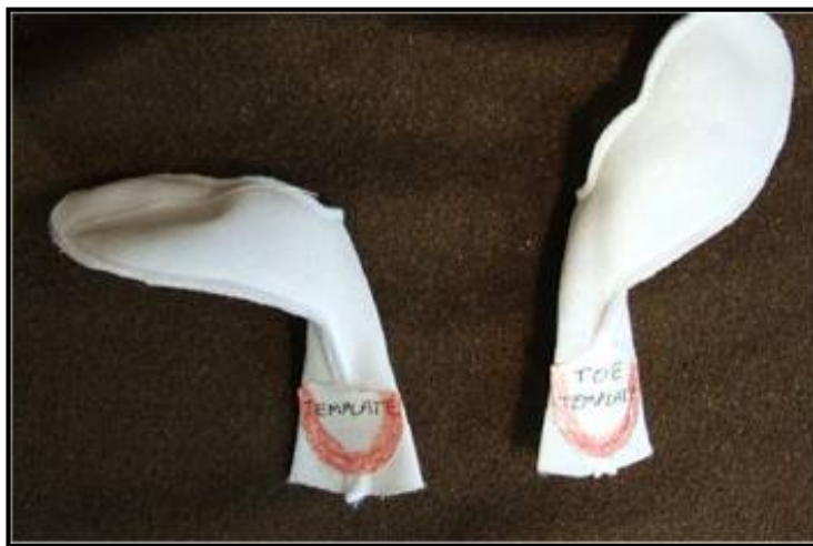
Toe templates in place for sewing.