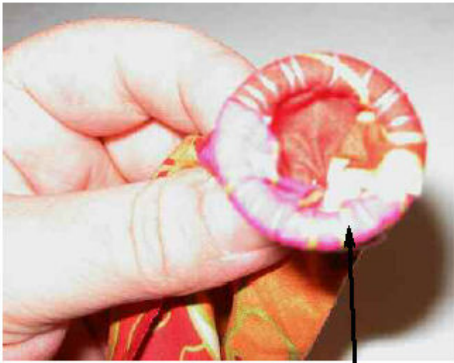
Curtain ring inserted and handstitched from the outside.

From the right side, stitch by hand all around the ring with an overcast stitch. This gives your fish a nice rounded open mouth.